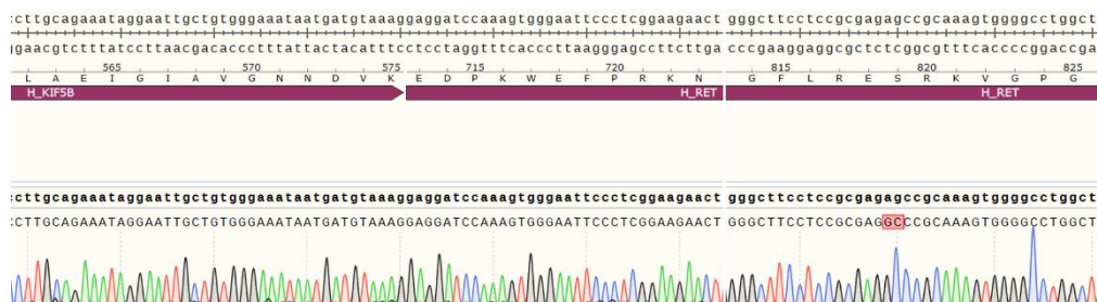
Figure 2 | The KIF5B-RET mutation analysis by Sanger sequencing.